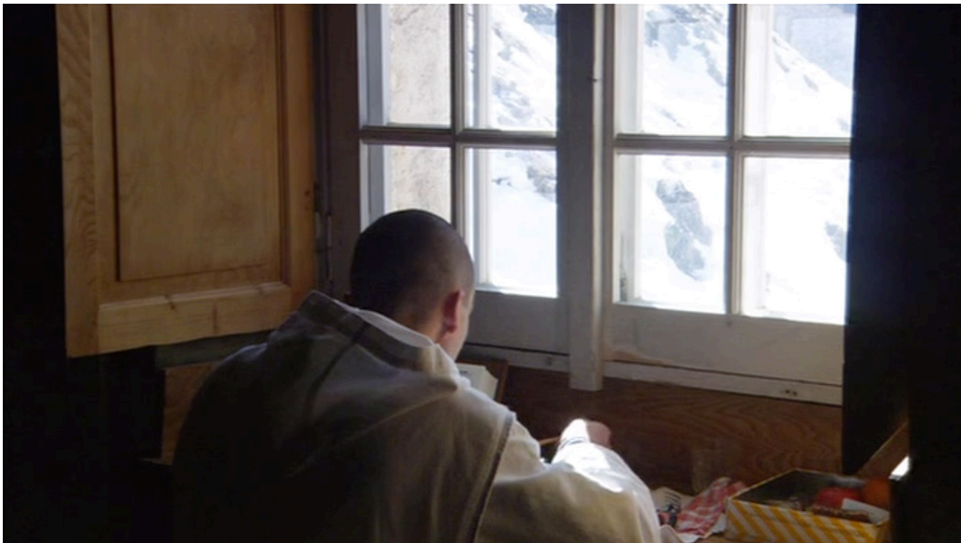
Figure 1. Into Great Silence (2005).

In 1984, then a twenty-five-year-old filmmaker interested in radical explorations of truth, Gröning sent a letter to the monastery asking for access to film. 13 He heard back from the monks sixteen years later. The austerity of that time frame inflects the film. Gröning's audiovisual documentation of the monks matches their asceticism. He strips filmmaking to its barest forms. The film does not use voice-over or music other than the plainchant of the monks at liturgy. Gröning shot the film using available light and mostly from fixed camera positions, except for some 8mm film used sparingly as a counterpoint to the rest of the work, which is shot with the starkly present-day feel of high-definition video. We are invited to linger over the images we see, exploring their contours, contemplating and getting lost in their forms (see fig. 1).