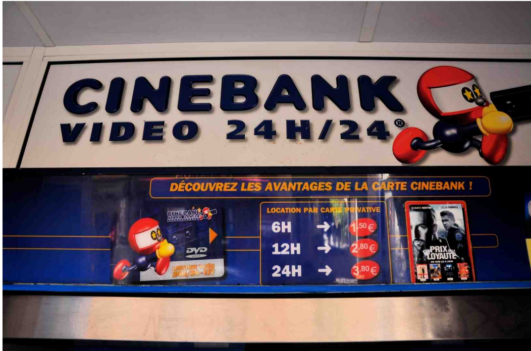
Figure 9. Cinebank Rate Chart at the rue Oberkampf location