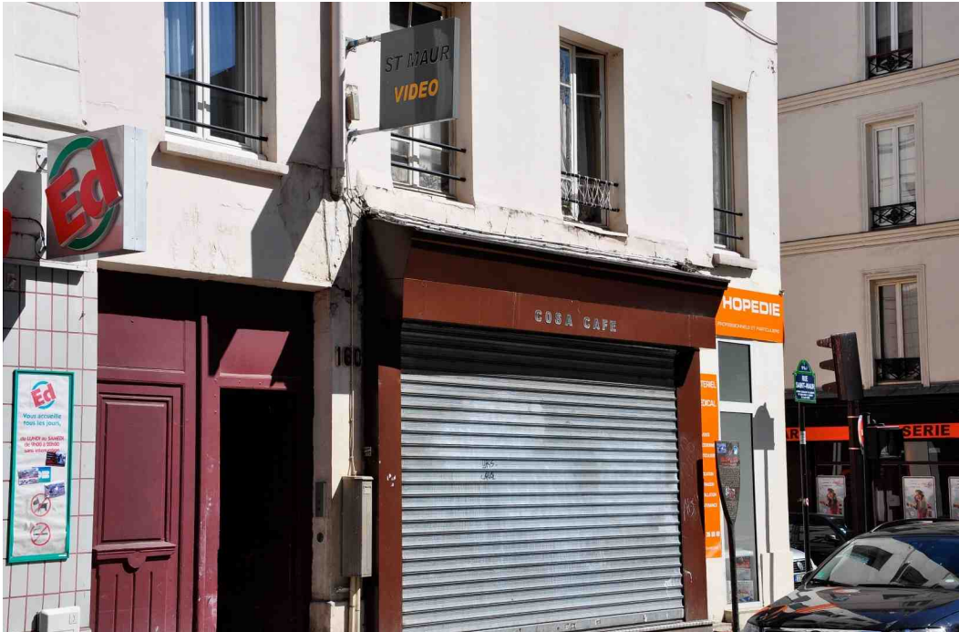
Figure 3. Former Site of St. Maur Video, 160, rue Saint-Maur, 75011 Paris