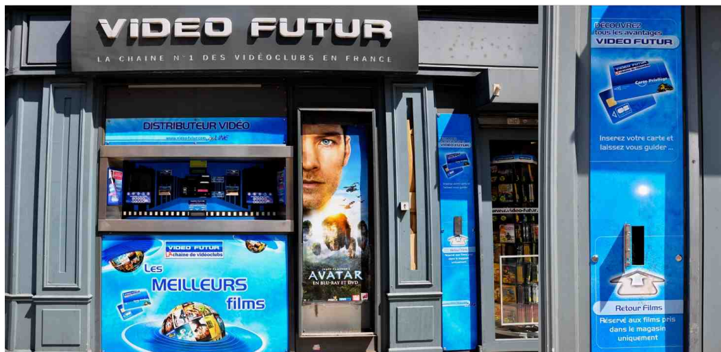
Figure 7. Automated machine at the 85, rue Monge Video Futur location