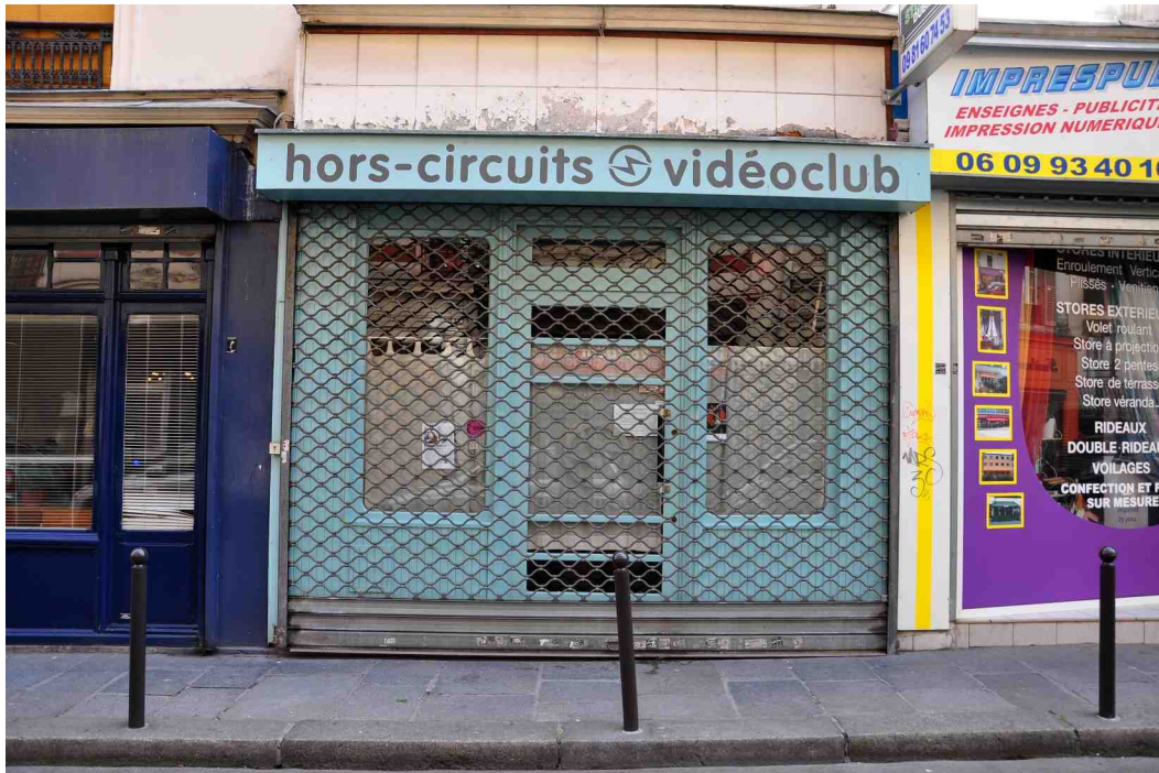
Figure 17. hors-circuits vidéoclub, 4, rue de Nemours, 75011 Paris. Closed, but only for summer vacation