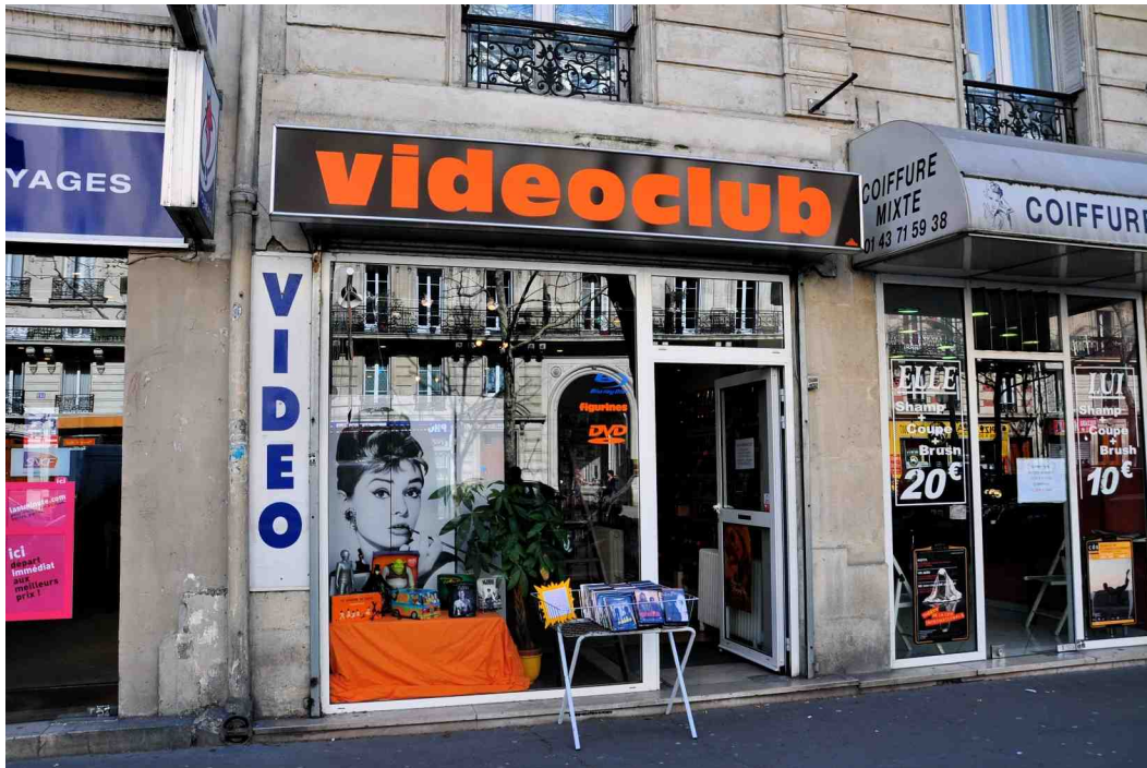
Figure 2. La Onzième Heure, 168, boulevard Voltaire, 75011 Paris