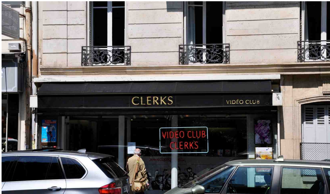
Figure 15. Clerks, 8, rue des Ecoles, 75005 Paris

Smaller stores, such as Clerks in the fifth arrondissement and JM Vidéo and Vidéo Club, both in the eleventh, also continue to eke out a living by combining new releases with large collections of French cinema, international art films, classical Hollywood, and other cinephillic fare. In each of these stores, owners explained that a large selection of classics, cult films, and documentaries, combined with popular new releases, remains one of their few remaining tools for competing with VOD and digital downloading. Several also referenced the continued importance of the store as a social space, where relationships and tastes co-evolve. In-store displays attempt to capitalize on the stores' large and diverse stocks by recommending classics and art films rather than relying on new releases that are more easily accessible through other distribution sites. Stores such as JM Vidéo also attempt to bolster profits through additional services including DVD repair, as well as used discs for sale and a small back room with adult films.