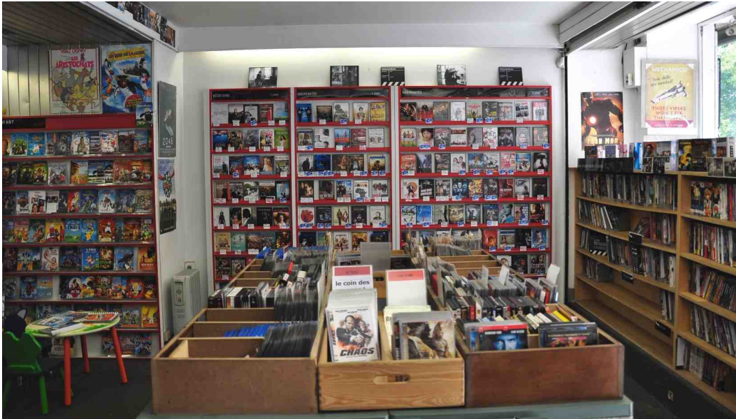
Figure 16. Clerks, interior view of display cases

Most independent owners we interviewed allowed that the prospects for survival in the current market remain bleak at best (several admitted that they only hope to stay open for as long as possible). At the same time, the success of stores such as JM Vidéo (open since 1982) and more recently opened shops such as hors-circuits vidéoclub (opened in 2003), suggest that the independent model remains viable, at least in the short term. Clerks, for instance, benefits from its proximity to a large university population, including many foreign students. The shop even offers an English language website. 35