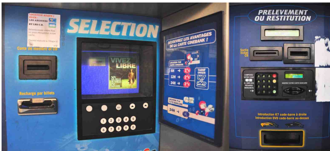
Figure 10. Cinebank machine details, rue Oberkampf location

The Cinebank brand operates 34 video stores and automated machines in Paris, including the location we visited at 115, rue Oberkampf. 34 The site