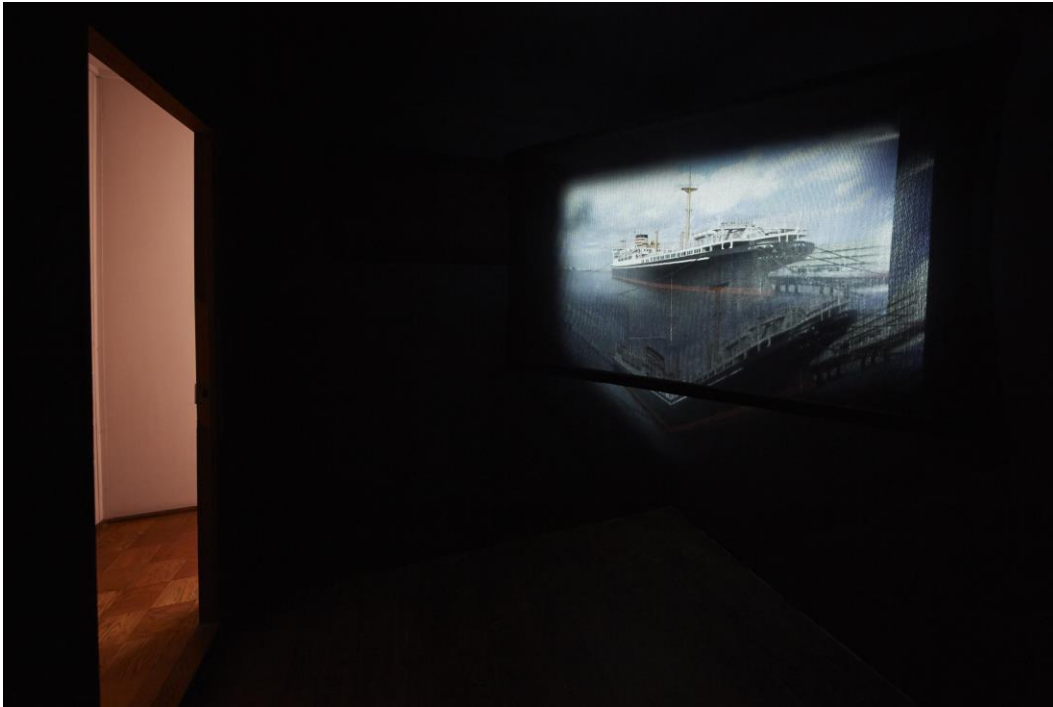
Figure 3. Port of Dream (2014), Cindy Mochizuki. Koganecho Art Bazaar, Fictive Communities Asia, 2014. Koganecho, Yokohama, Japan. Curated by Makiko Hara.

stuck to my skin, a haunting that is heavy. It is alive in this apartment. Like the dream of the ocean, it beckons me to listen.