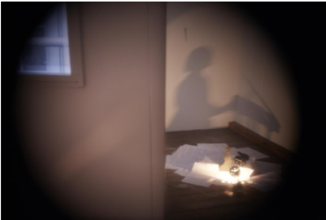
Figure 1. Port of Dream (2014), Cindy Mochizuki. Koganecho Art Bazaar, Fictive Communities Asia, 2014. Koganecho, Yokohama, Japan. Curated by Hakiko Hara.