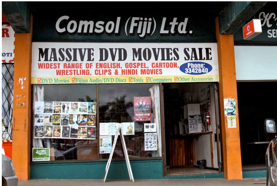
Figure 2. Comsol (Fiji) Ltd. is a local chain that sells DVDs as well as a variety of household items

Before DVDs, many stores in Suva sold VCDs and videotapes (some still do). Fiji's DVD industry, like many others, can be traced back to the emergence of the video store industry in the mid 1980s. By this time, Fiji had an estimated 30,000-40,000 video players and a growing video store market. 1 This equated to about one video player for every twenty people—a rapid spread considering that telephone density had reached this level only five years before (and subsequent to several decades of development). 2 The Fijian government embraced video technology: they set up the Fiji National Video Centre, sent their technicians for training in video production, and launched a vigorous audiovisual program on video. 3